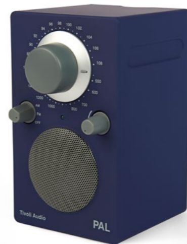
PAL (PORTABLE AUDIO LABORATORY) HIGH QUALITY SPEAKER