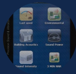
ONE TOUCH SETUP INTERFACE*