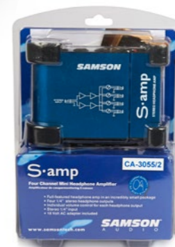
MULTI CHANNEL HEADPHONE AMP