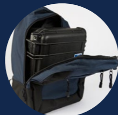
DISCREET RUCKSACK CASE HOLDALL