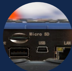
SD CARD SLOT FOR FASTER DOWNLOADING OF DATA