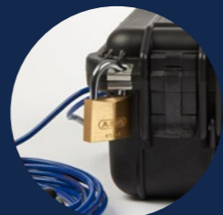
LOCKABLE CASE WHILST IN USE