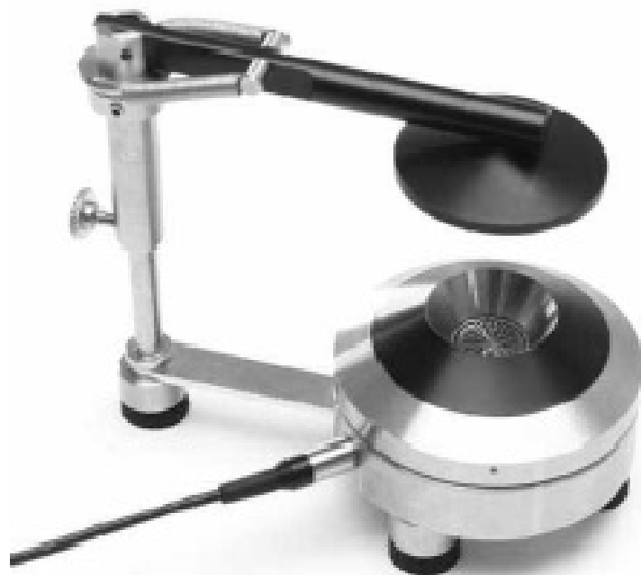
GRAS 434A Artificial Ear

Replaying audio recordings in a courtroom situation can be problematic but is invaluable in supporting your noise nuisance cases. It is hard for adjudicating officials to appreciate audio through speakers in large spaces where there will be background noise. Playback through several sets of headphones enables users to concentrate fully on the high quality audio files.