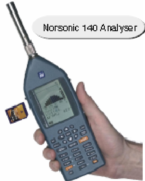
Norsonic 140 Analyser

Visit www.campbell-associates.co.uk for further information