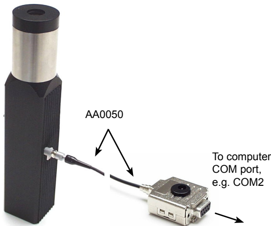
Fig. 2 Pistonphone connection for use with a computer

There is no flow control/handshaking; therefore commands must be sent one by one, waiting for each response.