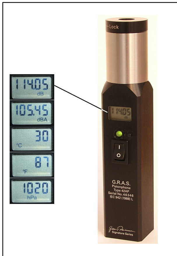
Fig. 1 Pistonphone Type 42AP, 114 dB at 250 Hz shown with an example of each possible display